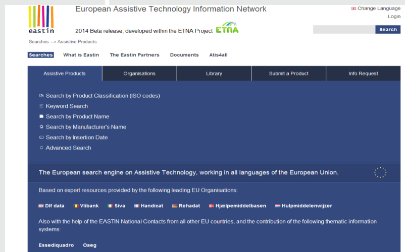
Homepage of ETNA- EASTIN 2.0

The cooperation between the two networks, also in collaboration with the European Assistive Technology Information Network ( EASTIN ), has led to the creation of two coexisting, communicating portals: the ETNA information system, a search engine that aggregates information from various providers and repositories all over Europe and beyond, and the ATIS4all collaborative portal, an open and collaborative portal that offers reliable information on ICT ATs, inclusive solutions and R&D initiatives, and fosters online discussion, exchange of knowledge, expertise and sharing of information among its different portal members, which aims to benefit all key actors in the value chain of ICT ATs and accessibility products (from research centres to end-users).